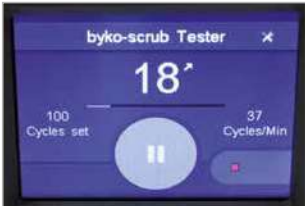
Gardner-scrub touchscreen display

The Gardner-scrub abrasion tester offers a versatile design for abrasion and washability testing applications. The instrument arm is designed to hold from 1 - 3 brush holders. A large selection of accessories is available to customize your test requirements. An intuitive touch screen operation makes it easy to change test parameters. The Gardner-scrub has a durable chain drive mechanism for long-term reliable operation.