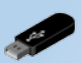
Data Transfer via USB